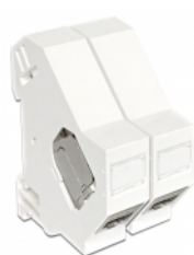
Anwendungsbeispiel mit Stecker