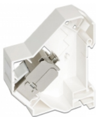
Anwendungsbeispiel mit Stecker