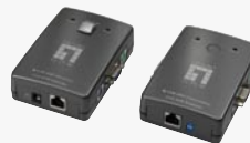
KVM-9005 KVM Cat.5 Extender Kit