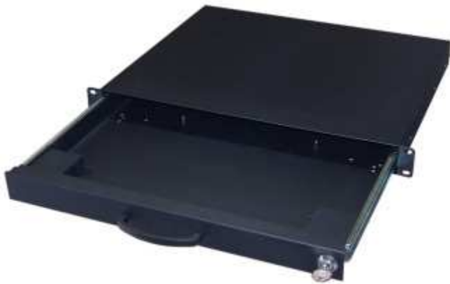
Photo shows keyboard-drawer equip 260420