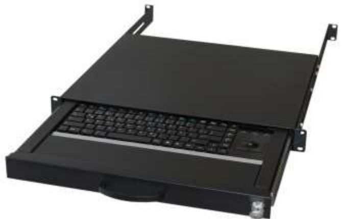
Photo shows keyboard-drawer equip 260621 with optional mounting rails equip 260920