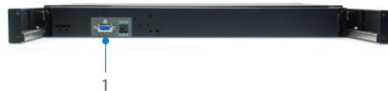
1. KCM Moudule Connector