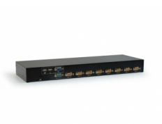
KCM-0832 8-Port KVM Switch Module