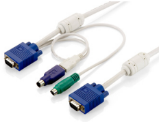
ACC-2101 1.8m KVM Cable, VGA, PS/2, USB