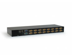
KCM-1632 16-Port KVM Switch Module

No liability or responsibility for any errors or omissions in the content. Specifications are subject to change without notice. All mentioned brand names are registered trademarks and property of their owners. Copyright © Digital Data Communications GmbH, Germany. All Rights Reserved.