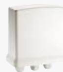
POS-4001 Outdoor High Power PoE Splitter (12V)