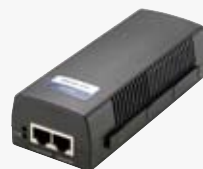
POI-3000 Gigabit High Power PoE Injector