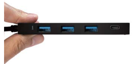
1cm Ultra-Slim thickness