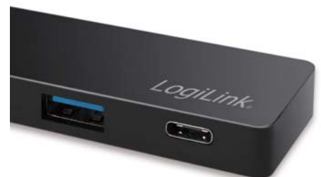
USB3.1 Gen1 port