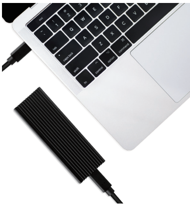
Plug and Play