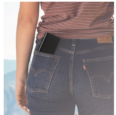
Pocket Size and Easy to Carry